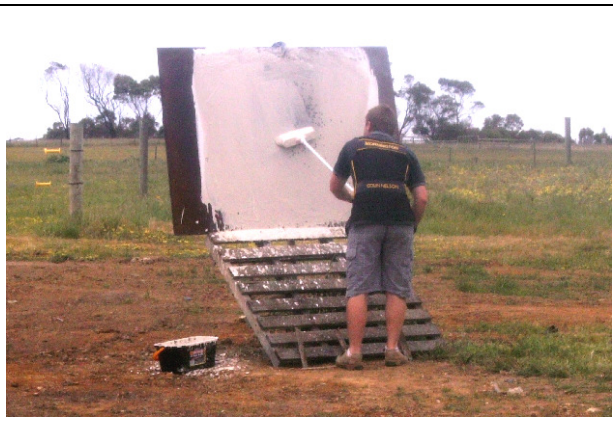
Col doing about the only shooting thing he has a talent for...