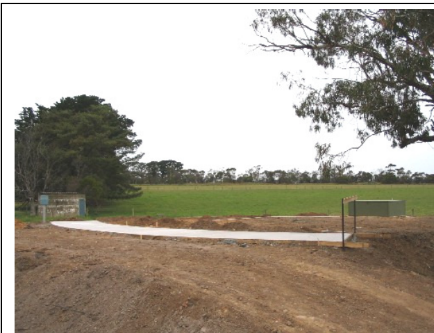
The whole layout as it is ...

A lot of time, effort and sacrifice has gone into this trap so please thank these folk when you see them around the club.