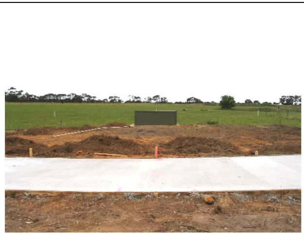
... and what a stunning view from Lane 3.