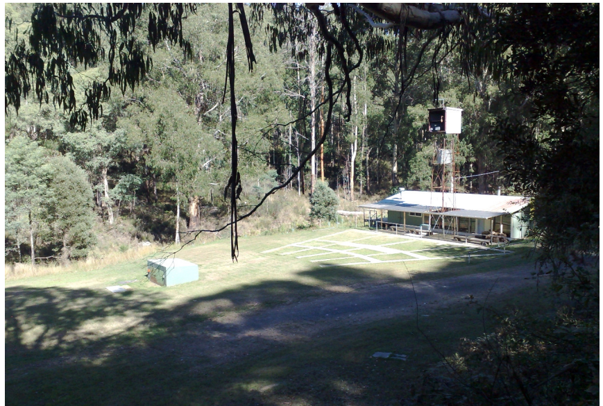
Nestled between a large hill and the very start of the Goulburn River, it's a beautiful ground.